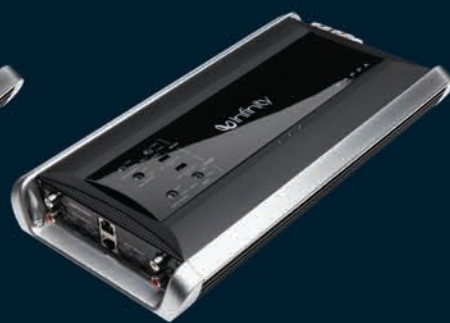
KAPPA FOUR 4-CHANNEL POWER AMPLIFIER