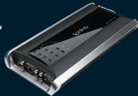
KAPPA FIVE 5-CHANNEL TOTAL-SYSTEM POWER AMPLIFIER