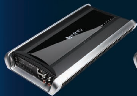
KAPPA ONE SUBWOOFER AMPLIFIER

IMS was developed to eliminate clutter and provide one easy interface for the integration of all your favorite devices. Bluetooth® phones, GPS systems, MP3 players or virtually any device with audio can use IMS as the central connection and control hub for your car audio system. IMS provides seven switchable inputs, and even has auto priority mapping to ensure that you don't miss an important call or a prompt from your GPS device. IMS can be used in virtually any car audio system and, when used in conjunction with Infinity IMS-input-equipped Kappa amps, installation is a breeze. Its brightly lit, easy-to-read display and controls are your perfect companions when you're behind the wheel.